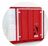
Forma-Stor COSHH FR300-C