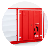
Forma-Stor COSHH FR400-C