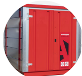
Forma-Stor COSHH FR200-C