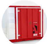
Forma-Stor COSHH FR300-C