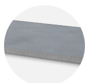
FSC2 shelf SHE-C2