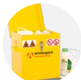
TransBank Chem TRB2C