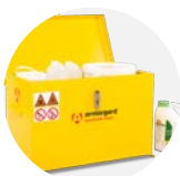
TransBank Chem TRB4C