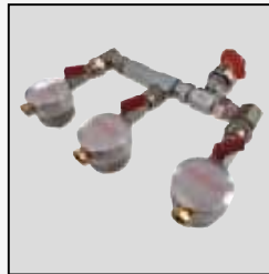
Parallel Tee 3 Gang AC.TFK.PT.3