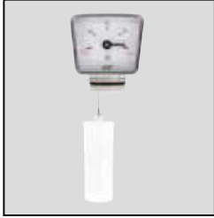
Clock Face GA.CG.4