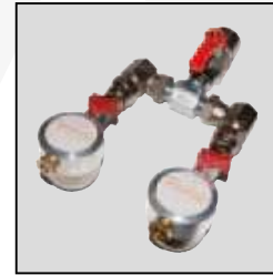
Parallel Tee AC.TFK.PT