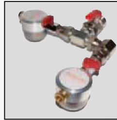
90° Tee AC.TFK.90T