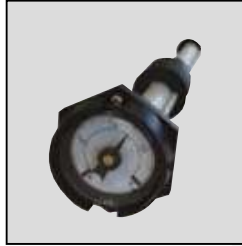
Spiral Float* GA.F2.4