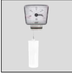
Clock Face GA.CG.4