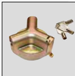
Spin Secure Tank Lock TL.020