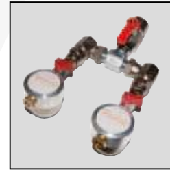
Parallel Tee AC.TFK.PT