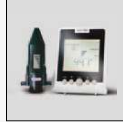
Sonic Smart GA.AP.SM