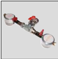
Straight Tee AC.TFK.ST