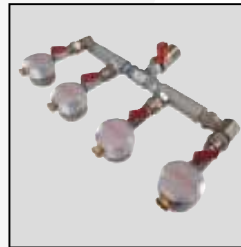
Parallel Tee 4 Gang AC.TFK.PT.4