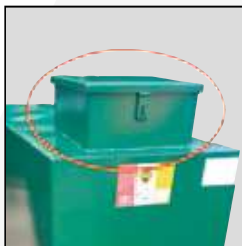
Locking Lid EXT.LID